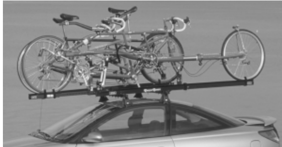
Specialty Roof Racks